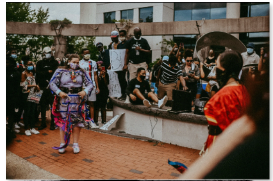
On June 5, there was another peaceful protest that saw twice as many people marching down to city hall in Moncton. This time, our indigenous communities also came together in solidarity.

Nellys: The one thing we all have in common is a voice . Those who are not protesting, they can talk about it and find other ways to support it. I feel like people are afraid to speak up, but they know there is a problem and want to make a difference . People want to make a difference. People can come together and even if you aren't comfortable talking about it or going out and marching, you can share on social media, you can petition and the small things people will do will make a difference.