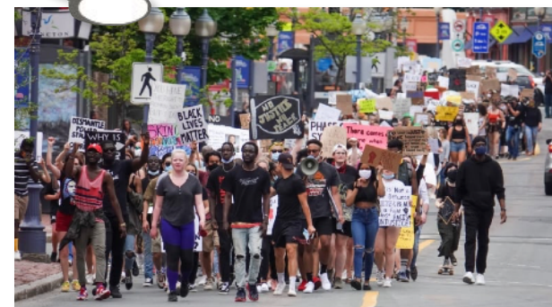
Demonstrators carry signs and march in downtown Moncton, N.B., on Friday.